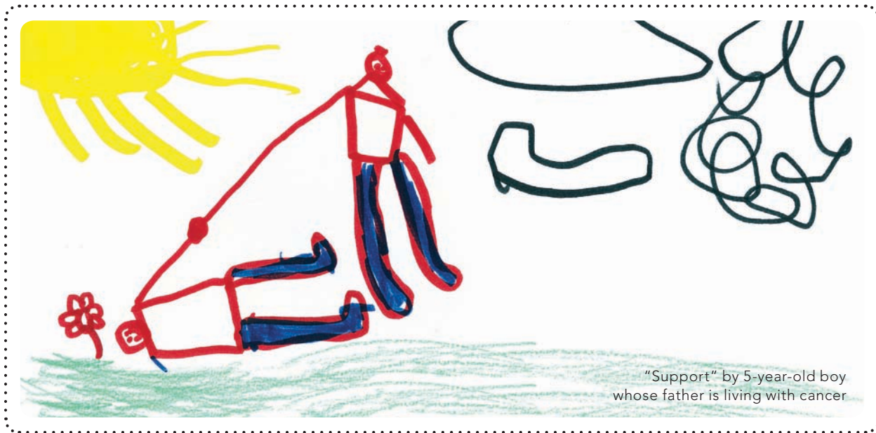
"Support" by 5-year-old boy whose father is living with cancer