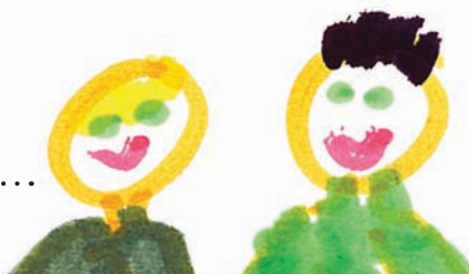
Artwork by 7-year-old girl whose father is living with cancer