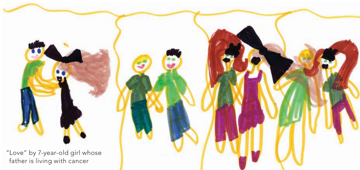
"Love" by 7-year-old girl whose father is living with cancer

66% OF PARENTS ANSWERING A CANCER SUPPORT COMMUNITY SURVEY SAID THAT THEIR CHILD(REN) DID NOT TALK OPENLY WITH THEM OR SHARE THEIR FEELINGS ABOUT CANCER.