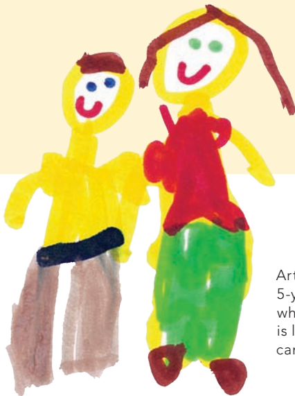
Artwork by 5-year-old boy whose father is living with cancer

“Magical thinking” : Thinking they did something to cause cancer (e.g., “I wouldn’t go to sleep and kept Mommy awake. She was very tired and I think I made her sick.”)